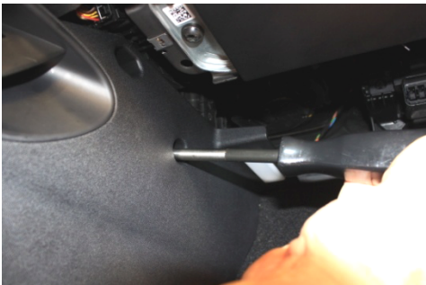
4. Using T20 Torx remove screw on forward most center console kick panel. Pull out rear of panel first to un-clip, then slide rearward (passenger side shown).