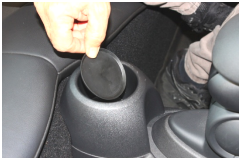
7. Pick out rubber pad at bottom of rear cup holder.