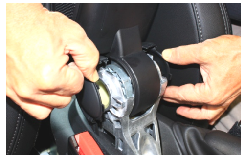
11. Spread open rear cover then slide rearward to remove.