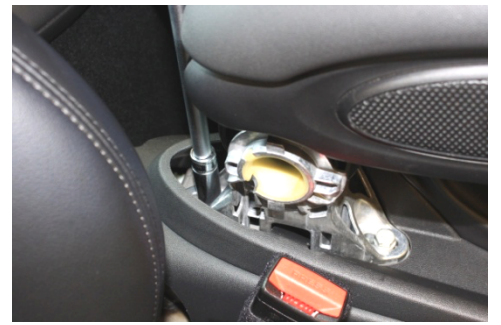
12. Using 13mm socket unbolt the (2) arm rest mounting bolts, then remove.