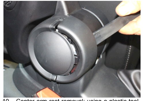
10. Center arm rest removal; using a plastic tool, pry forward to unclip the front half of cover towards front of vehicle to remove.