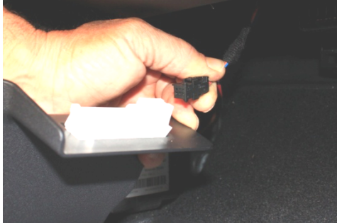
5. Disconnect interior lamp electrical connector from kick panel. Repeat on driver side.