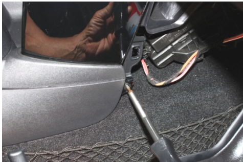
6. Using T20 Torx remove screw at front of center console. Repeat on driver side.