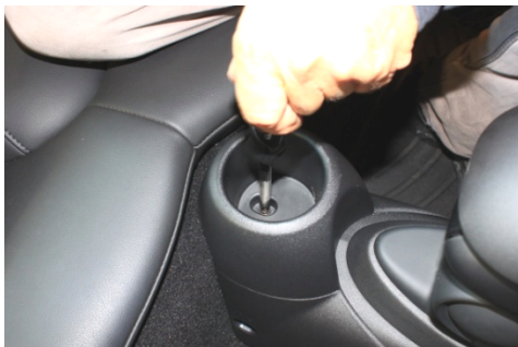
8. Using T20 Torx remove the (1) screw inside cup holder and the (1) screw on each side, then lift off from center console.