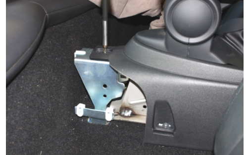
9. Using T20 Torx remove the (1) screw at the top end of console and the (1) screw on each side.