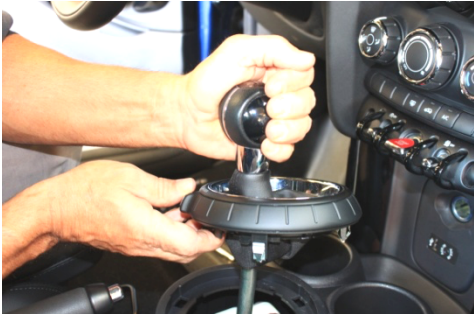
3. Pull shift knob straight up to remove.