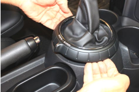
1. Lift up from underneath Drive Mode ring to un-clip from center console.