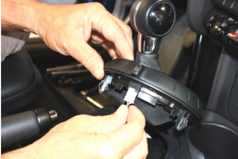
2. Disconnect electrical wire connector from ring.